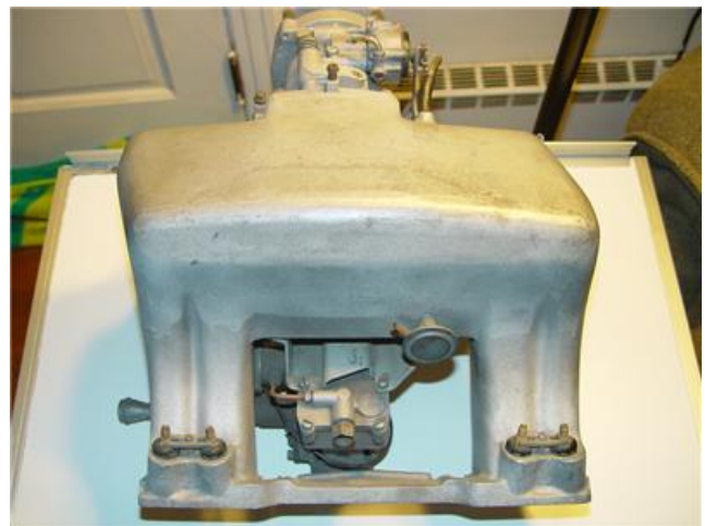
ROCHESTER FI UNIT FOR WHAT???? TELL ME YOUR BEST GUESS

YA GOTS ANY PICTURES YA WANTS TO BE INCLUDED IN THE NEXT ISSUE???