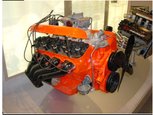
THE MARK II 427 MYSTERY ENGINE. FORE RUNNER OF THE MARK IV ENGINE