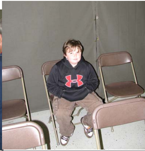
We are recruiting young.