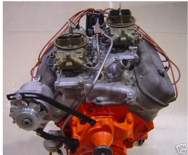
THE ENGINE THAT SHOULD HAVE BEEN BUT NEVER WAS, THE SEMI HEMI SMALL BLOCK