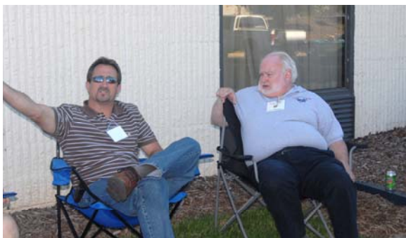
Honest, he went that way!