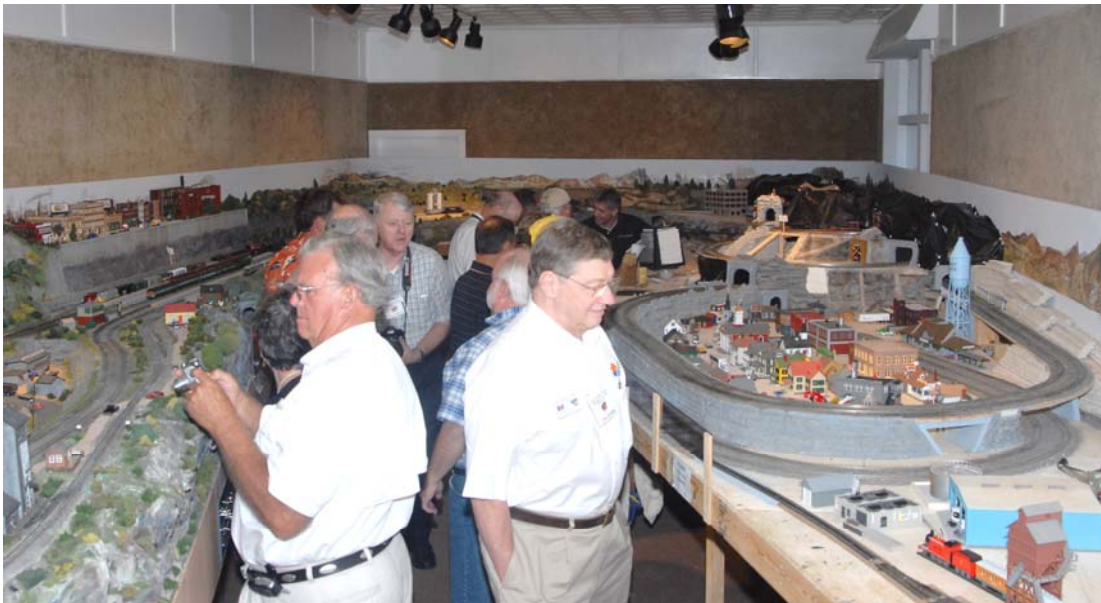
Trains and more trains for the boy in all of us